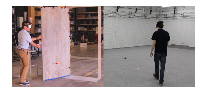
Figure 1: Left: Location A with physical door using PhaseSpace tracking. Right: Location B using VICON tracking.

For motion tracking, one space uses PhaseSpace and the other uses VICON. The major system components are outlined in Fig. 2.